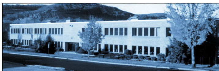
LSI Corporate Headquarters