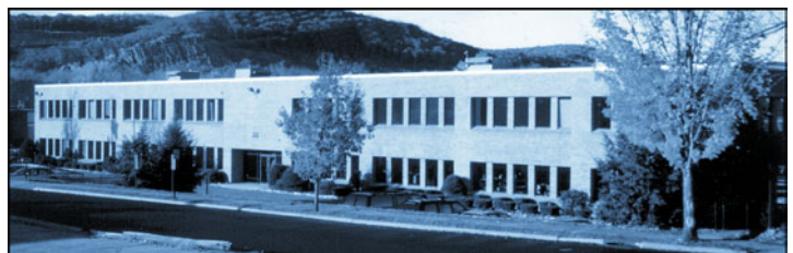
LSI Corporate Headquarters