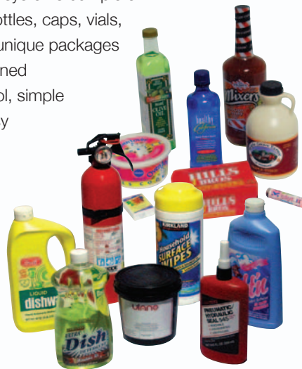
LSI provides systems to label nearly any kind of product or requirement, including side panel, top panel, wrap around, corner wrap, front and back, leading/trailing, bottom labeling, and print and apply.

LSI manufactures a complete line of standard pressure-sensitive labelers. Our modular approach to design allows for easy integration, changeover and upgrades.