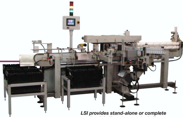
LSI provides stand-alone or complete turnkey labeling systems, including product handling and sensing equipment for most applications or label requirements.

All products and solutions are designed and rigorously tested by LSI's dedicated team in our Research and Development Electronics Laboratory and state-of-the-art manufacturing facility. LSI stands behind our products with outstanding customer service, including in-house training, parts and professional service and repair.