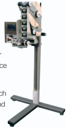
Portable head mounts such as t-base stands are standard options along with custom head mounts to match specific customer needs.